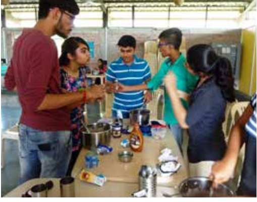
Everything is designed to open up hidden talents of children...