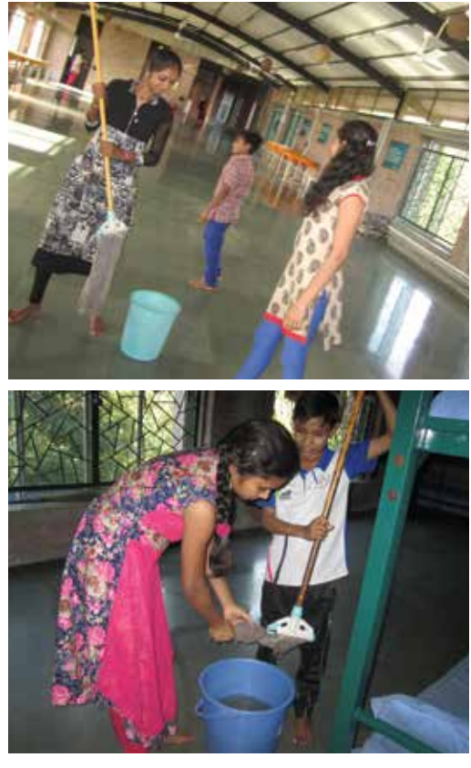
Voluntarily they clean the 'yuck' toilets, mop the floors, tend the garden, dispose of the waste, clean the utensils, help in the kitchen, clean the dorms and halls and attend the guests to show them Oasis Valleys. They do it with a tremendous sense of responsibility. They all do these with much love, joy and without much supervision.