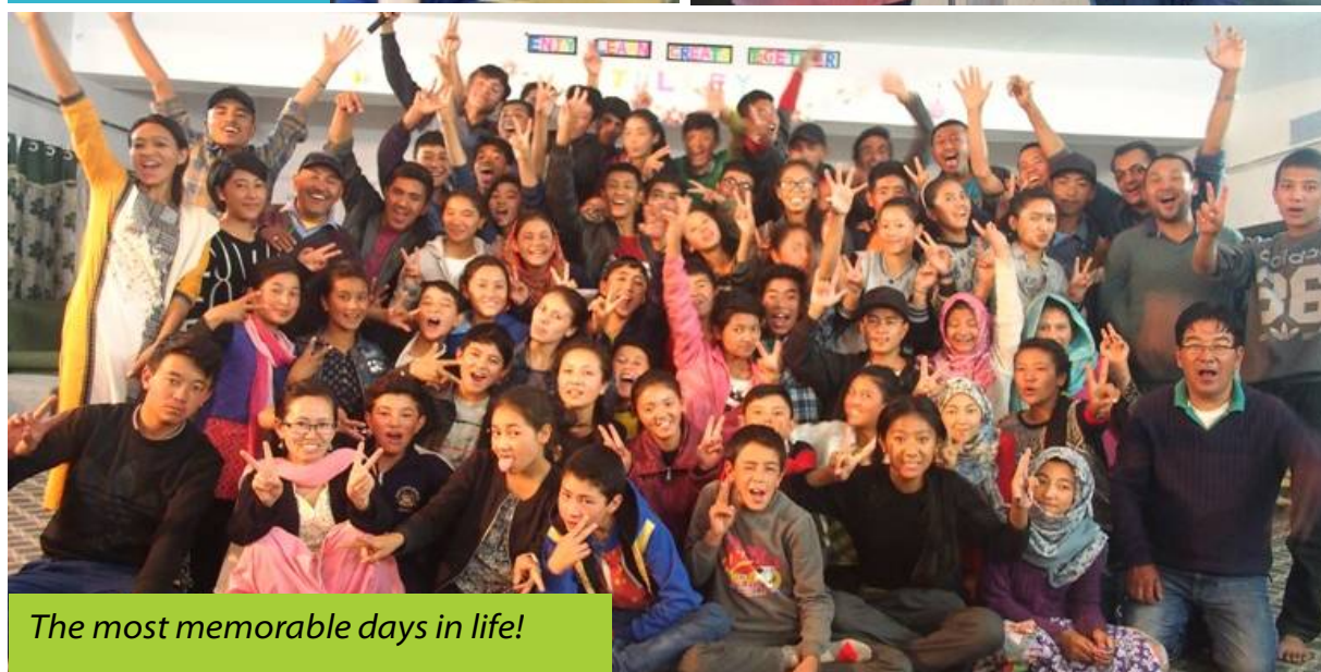
The most memorable days in life!