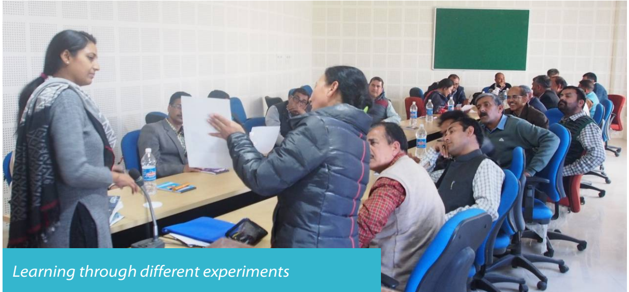
Learning through different experiments