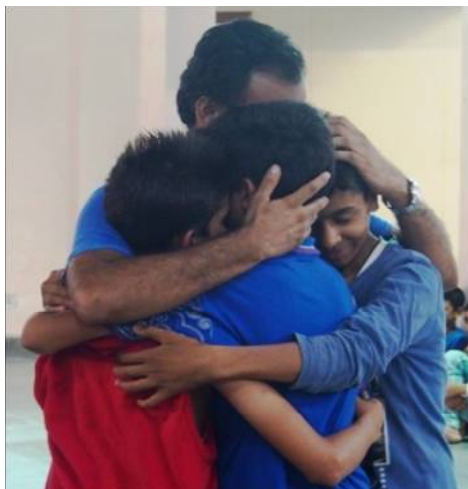
Children loved the facilitator