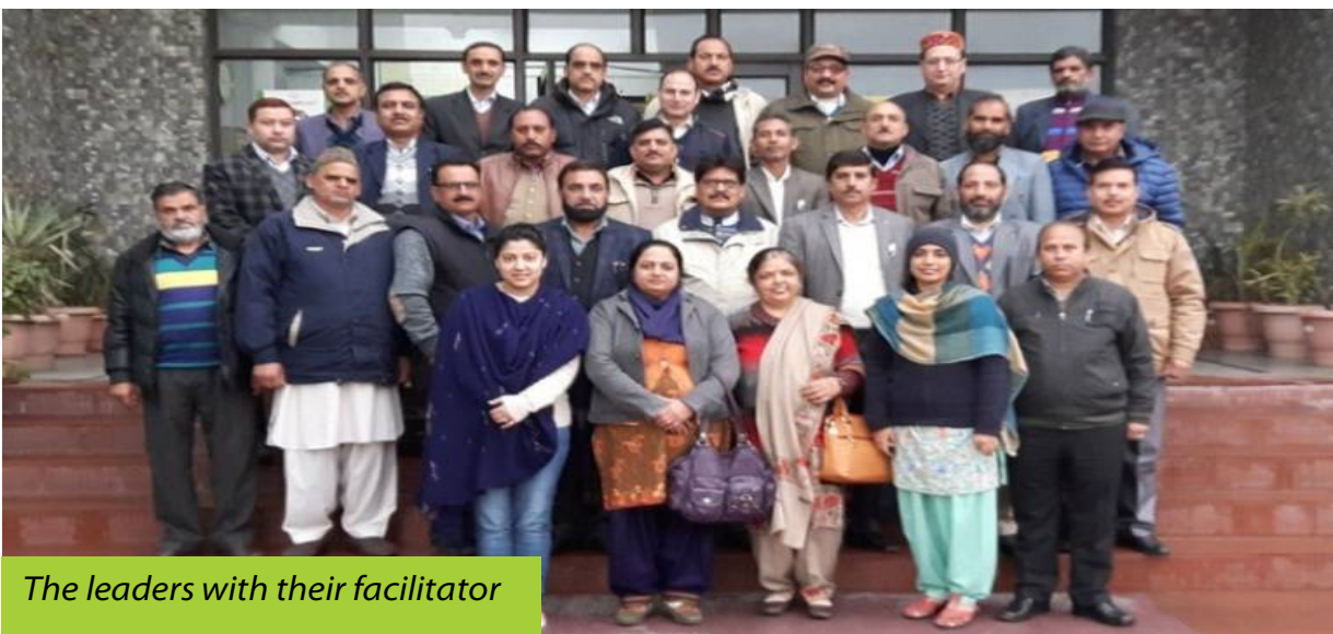
The leaders with their facilitator