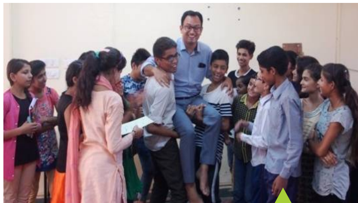
Warm farewell to faculty, returning love received in the sessions