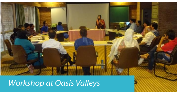
Workshop at Oasis Valleys