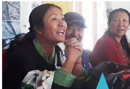
Participant sharing her experience