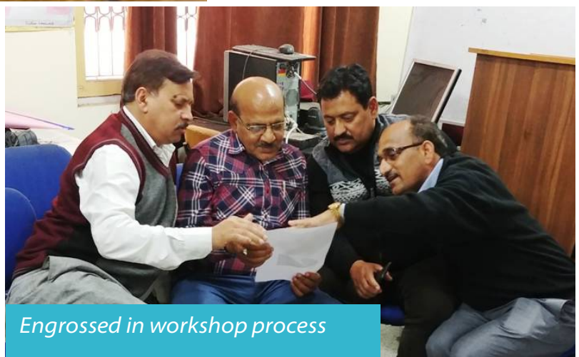
Engrossed in workshop process