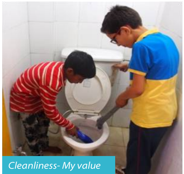
Cleanliness- My value