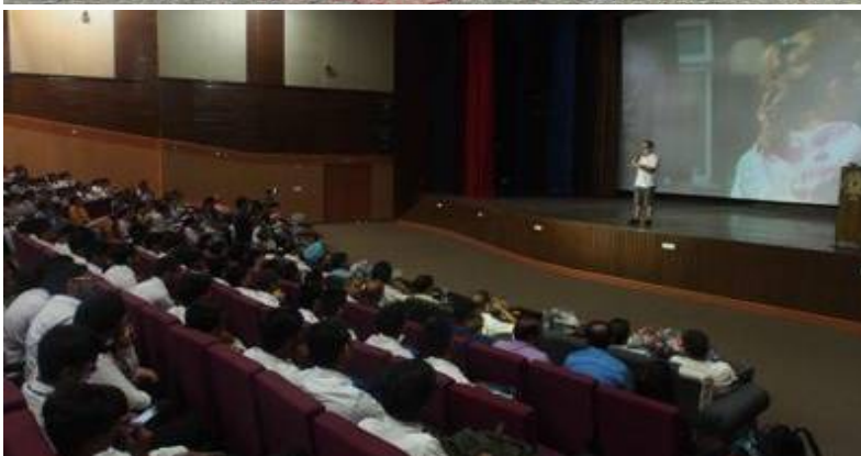
Henry inspired 500 People at J & K