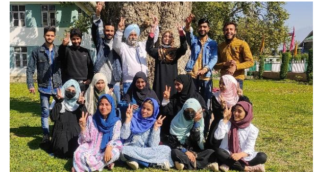
L3 Misaal winners in Kashmir