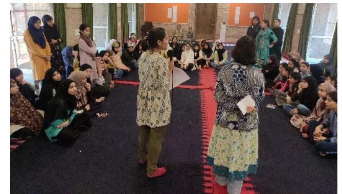
Appreciation in Star Assembly