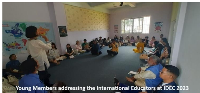
Young Members addressing the International Educators at IDEC 2023