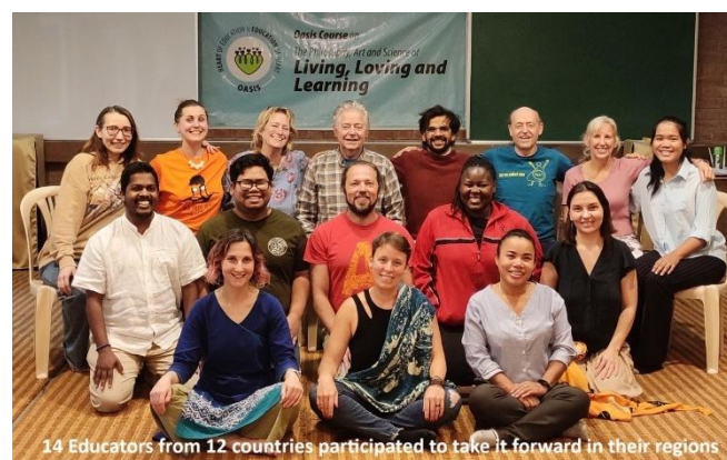
14 Educators from 12 countries participated to take it forward in their regions

Convention: 25-28 January, followed by L3 Workshop and Facilitator training: 29 th Jan to 5 th Feb, 2024 .