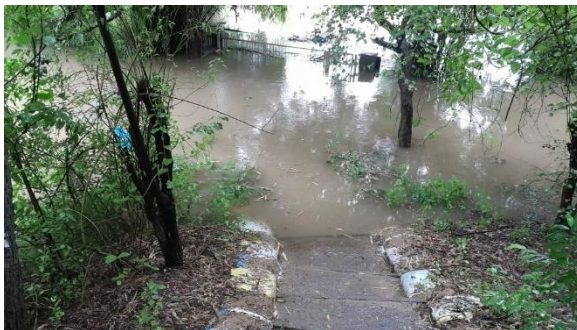
Back Gate of the Campus