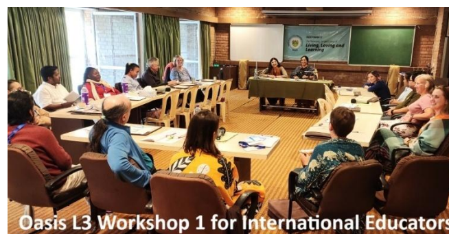
Oasis L3 Workshop 1 for International Educators