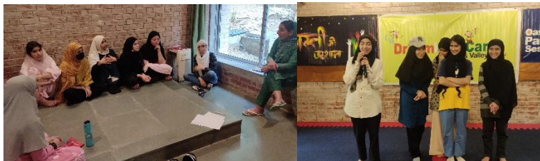
Sessions for Empowerment

The routine was helpful for my mental and physical health and it was hectic but was good for me. A person can be successful if he/she has such good habits of food and routine.